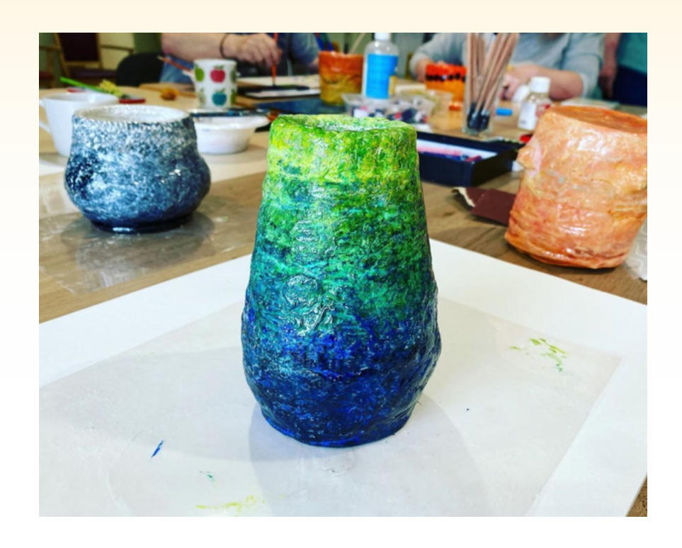
Participant's experimenting with clay and orizone technique in our workshops